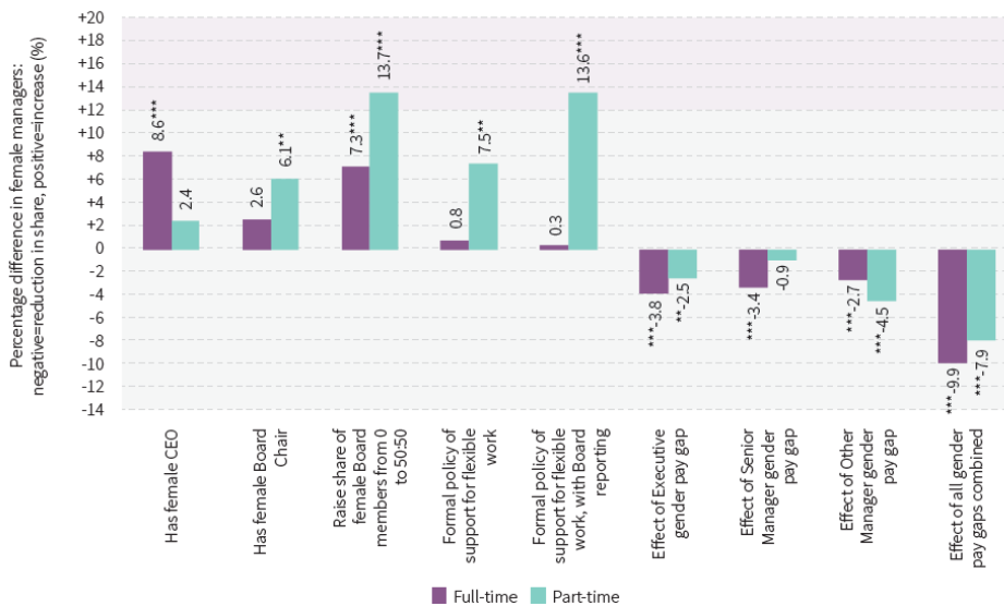
FIGURE 4 Effects of company policies and characteristics on shares of female managers, full-time and part-time workers, 2018

Notes: Figures show the percentage changes in shares of female managers attributable to specific policies, or to changes in company characteristics. Data include only those organisations present in both the 2016-17 and 2017-18 WGEA reporting data. Marginal effects of policies and characteristics on outcomes are marked as statistically significant at 1% (***) or 10% (*).